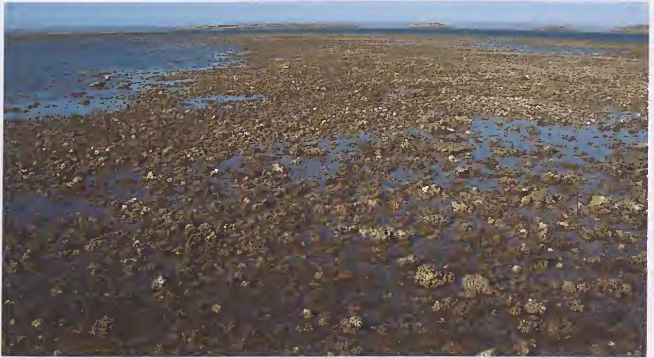
Figure 12. Rhodolith bank on the reef crest; S.E. Montgomery Reef ( 15^{\circ}55.331'E ; 124^{\circ}18.851'E ; elevation c. 4 m). Mid-littoral reef flat on the left; High Clifly Reef and islands in the background.